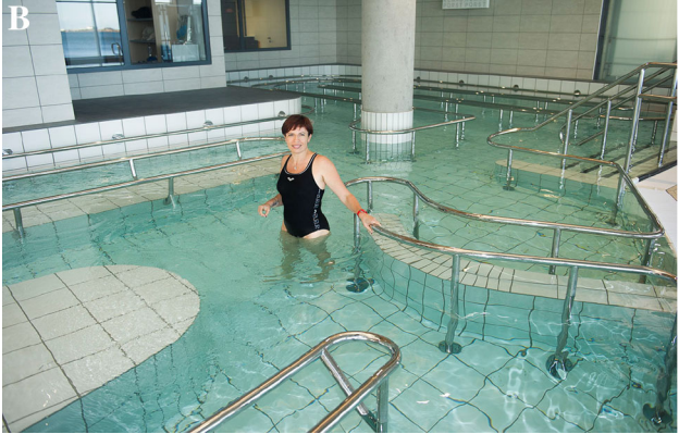
Fig. 1 a View of the interior facilities related to falls prevention, b the walking corridor [14, 15]

In 2014, Balaruc-les-Bains became the most frequently visited Spa in France. This represents more than a third of the increase in French balneotherapy over the same period.