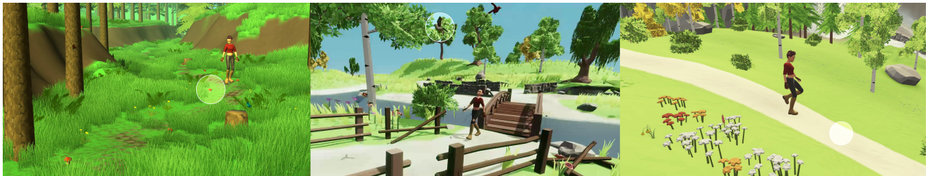
Figure 1: Our method automatically generates a virtual character’s gaze animation (eye and head movement), making it look aware of its environment. Our visual attention model considers the character’s path, the slope of the terrain, and the salience of shapes and movements of surrounding elements.

Marie-Paule Cani LIX, École Polytechnique, France