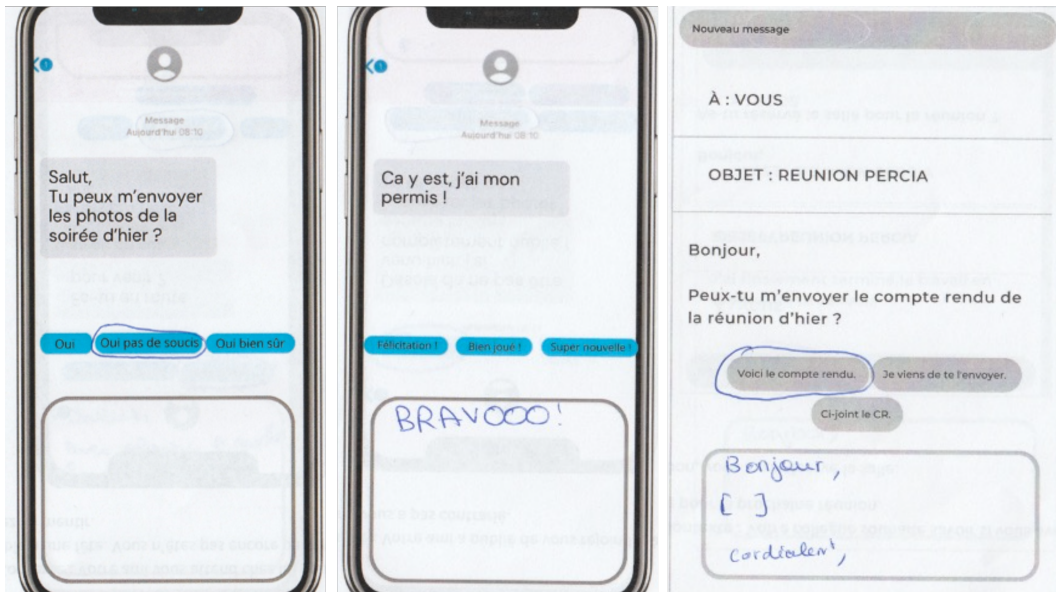
Figure 3. Sample of various answers to our survey. In the first example (left) the participant chose to answer using a smart reply ("Hi, can you send me the photos from yesterday's party?" answered with "Yes no problem"). Second scenario (middle) showcases the use of free text to answer the initial message ("I finally got my driver's license!" answered with "BRAVOOO!"). The third example illustrates combined use of a smart reply supplemented with text, the smart reply is displayed as [...] in the free text area ("Hello, Could you send me your notes on yesterday's meeting?" answered with the smart reply "Here are my notes" and the participant added "'Hello, [smart reply] Regards").