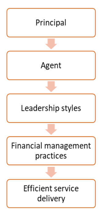
Fig. 2. Illustrates the agency theory framework of the study