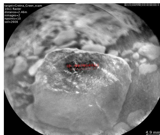
Figure 3: The target Greta_Green shows an exceptional combination of Mg and Ni enhancements and was previously suggested to be a chondrite [10].