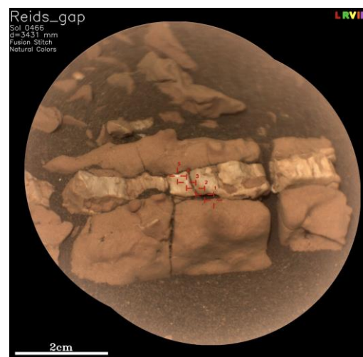
Figure 4: Calcium-sulfate veins such as the target Reids_gap sampled on sol 466 at the delta front can be identified by their high S spectral unmixing score together with high Ca.