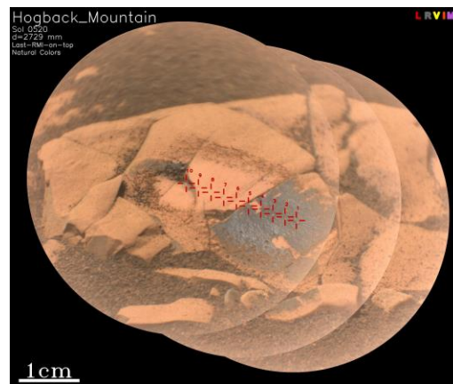
Figure 3: The bedrock target Hogback_Mountain was analyzed with SuperCam on sol 520 at the delta front. Its high Mn scores from the dark-coated region are unique within the SuperCam data set.