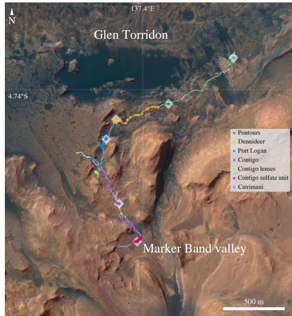
Figure 1: Map showing the clay-sulfate transition region explored by the Curiosity rover. The traverse starts at the Mont Mercou outcrop in the upper right part of the map and extends South (uphill) until it reaches the beginning of the orbitally defined sulfate unit in the Marker Band valley. White line indicated the rover traverse, colored points reflect ChemCam bedrock targets and the geologic member they sample, white diamonds indicate where drill samples were collected.

Results: Based on rover observations, the CST bedrock was found to record a substantial wet to dry change in depositional environment as rocks above the Pontours member were found to be deposited in a dry aeolian environment, although with lenses in the Contigo member believed to have formed in interdune lakes [8-9] (see fig. 1 for localities and members noted). Similarly, the mineralogy was observed to change substantially already from the base of the CST, most notably reflected by a complete loss of clay-minerals [10]. Compared to the marked shift in mineralogy and depositional environment, a homogeneous geochemistry is observed across the transition from the clay-mineral rich Glen Torridon region and into the CST. The most notable change relative to previous ChemCam bedrock observations in Gale crater was a subtle, but consistent, decrease (approximately 5 wt.%) in the total sum of major oxides quantified by ChemCam noted across the Pontours member.