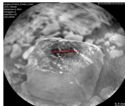
Figure 5: The target Greta_Green shows an exceptional combination of Mg and Ni enhancements and was previously suggested to be a chondrite [10].