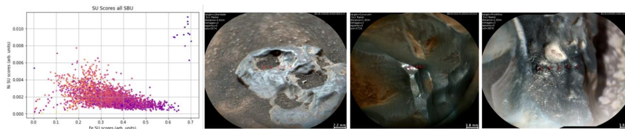
Figure 2: Three iron-nickel meteorites informally named Liberdade , Curucium and Priolithos (RMIs shown on the right) were easily identified by means of their unusual high iron and nickel scores (left) in the data from sol 3110 onwards.