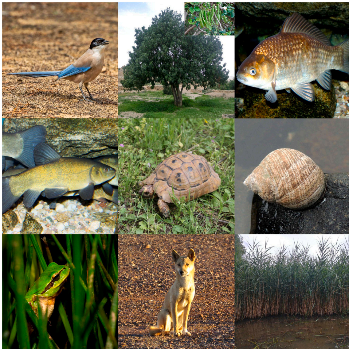
Fig. 1. Examples illustrating that nativeness is a binary concept, even though describing it may present challenges. From left to right and top to bottom: the Iberian magpie Cyanopica cooki , native to the Iberian Peninsula; the carob tree Ceratonia siliqua , native to the Western Mediterranean; the crucian carp Carassius carassius , non-native to the UK; the tench Tinca tinca , non-native to the Iberian Peninsula; the spur-thighed tortoise Testudo graeca , probably non-native to the Iberian Peninsula; the common periwinkle Littorina littorea , non-native to North America; the Mediterranean tree frog Hyla meridionalis , probably non-native to Europe; the dingo Canis familiaris dingo , non-native to Australia; and the common reed Phragmites australis , both native and non-native to North America. For further explanations, scientific literature and photo credits, see Appendix A.

Nativeness refers to the property of a taxon occurring within its natural distribution range, where it has evolved and its presence, whether present or past, is not a result of direct human intervention (Pyšek et al., 2004). Complementarily an organism is considered non-native in a particular area if its presence there is human-mediated (Essl et al., 2018; Gilroy et al., 2017). A source of uncertainty in these complementary concepts can arise from the spatio-temporal dynamics of species ranges (Warren, 2007; Pereyra, 2020), which can be expedited by rapid global change (Webber and Scott, 2012; see neonative term coined by Essl et al., 2019). In certain cases, due to spatial patterns, it is more straightforward to discern (e.g., an African freshwater species