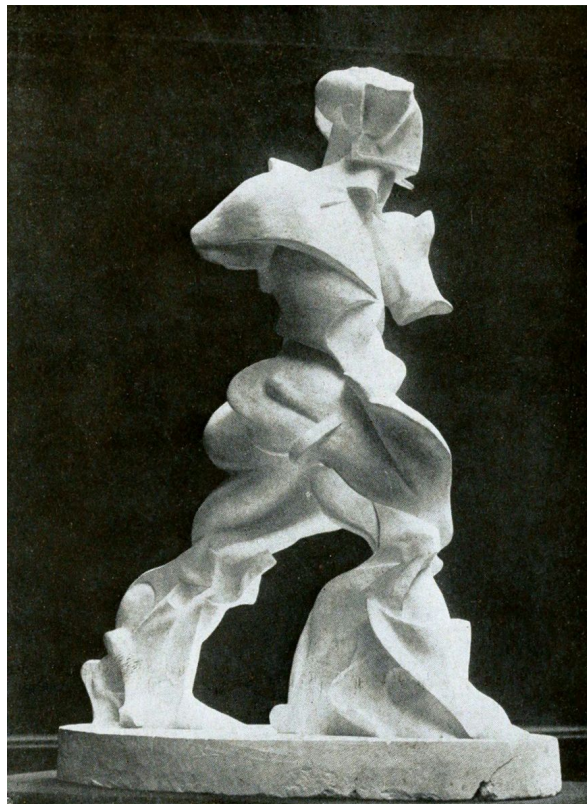
Figure 1. Umberto Boccioni, Spiral Expansion of Muscles in Action , 1913.

Time and space are intimately linked through movement. To enhance the richness of the visual language, we need to visualize the movement of entities through static simulation, as done in Spiral Expansion of Muscles in Action by Umberto Boccioni, the Futurist artist who introduced the art of depicting sculpture in movement (Figure 1). We do not need to draw more actors or relations, it is enough to improve their representation with a more elaborated shape. In this way, complexity will be managed not only in terms of infinite spatial entities and relations, but also in terms of infinite time-based entities and relations.