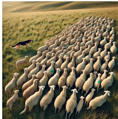
(b) Gathering the herd