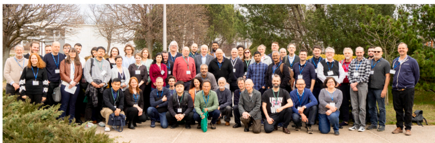
Fig. 1 Group photo.