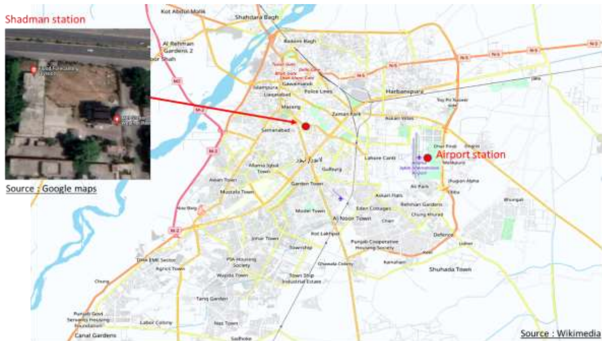
Figure 1: Location of weather stations in the Lahore area.

The daily minimum and maximum temperatures were then homogenized with the HOMER method (version 2.6) and analyzed. Details about the data and homogenization, as well as the evaluation of the temperature trends and discussions about these trends, are provided in Sajjad et al. (2021). The temperature trends of the period 1980-2004 are also reported in section 3.4. Though the urban station is probably not representative of the mean city temperature, the time evolution of the temperature observed on this station will be compared with the one estimated from Equation 1 to evaluate the order of magnitude of our estimations. This representativity issue will be a source of uncertainty in the comparison.