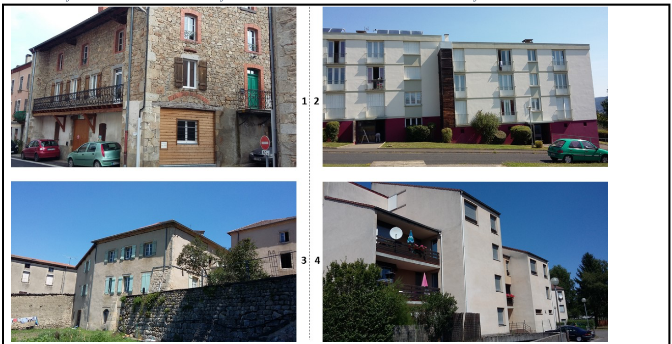
Photo 1 : The CADA Détours in the territory of Ambert. AUTHOR , 2017. 1- The offices of the association Détours in Cunlhat. 2- CADA's facilities in Arlanc. 3- CADA's facilities in Saint-Amant-Roche-Savine. 4- CADA's facilities in Ambert.

The scattered CADA FOL 74 (Photo 2) facilities, that have opened in 2016, are located in the department of Savoie, in three municipalities: Saint-Pierre-d'Albigny (cluster 1), Montmélian (cluster 2), and Val d'Arc 7 (cluster 3). The mayors of the three municipalities – part of the left-wing parties Parti Socialiste in the case of Montmélian) or left-wing political orientations (Sans étiquettes-divers gauche in the case of the two other municipalities) – are less committed in the CADA's creation process, compared to the previous case. This is due to the lack of need to maintain public services, such as schools. Nevertheless, the mayor of Val-d'Arc highlighted the need to accommodate persons who have more possibilities to access to the refugee status (interview with social workers at the CADA FOL 74). The mayor is described by the team of the CADA as more paying attention on the arrival process in his municipality and less open to build strong collaboration with the CADA's team in relation with the reception of asylum seekers.