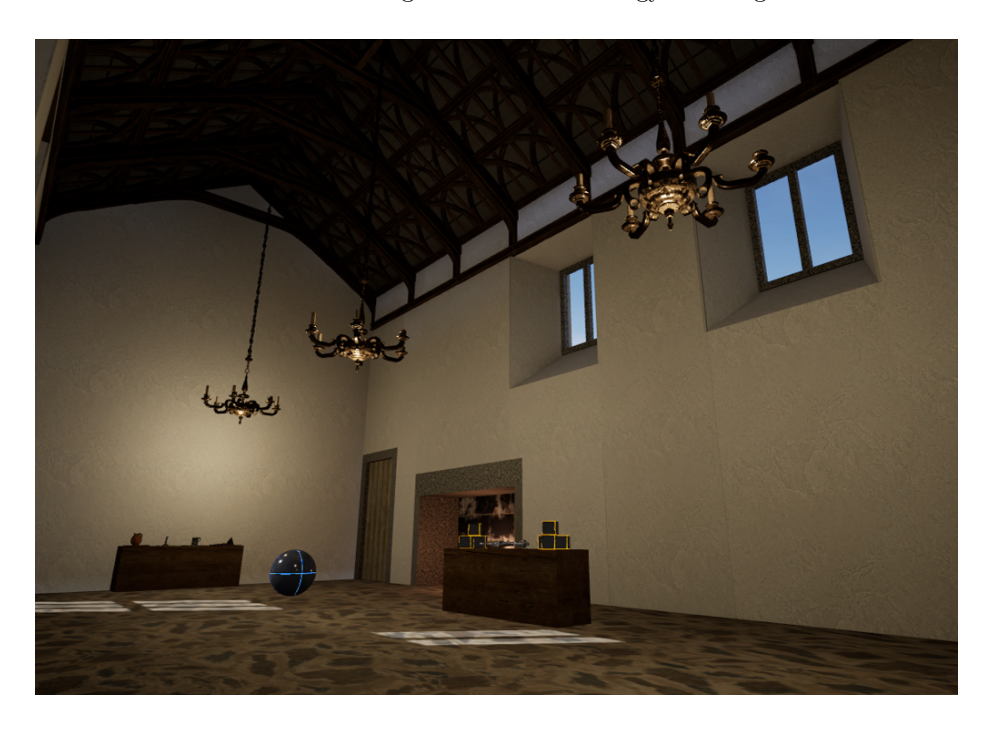
Fig. 2. Screenshot from an early digital model of Cotehele, showcasing the interior of the Great Hall. Participants explored the environment and interaction options to understand the spatial dynamics and test different locomotion methods suited to the setting. Reproduced from [11].

the side button or using the thumbstick — more challenging. As a result, for the upcoming sessions for the XR work package, we plan to introduce a series of workshops dedicated to the co-design and integration of a custom controller — whether through unique control mapping or a specially designed controller — that accommodates the participants' varying mobility needs while preserving the immersive quality of the experience.