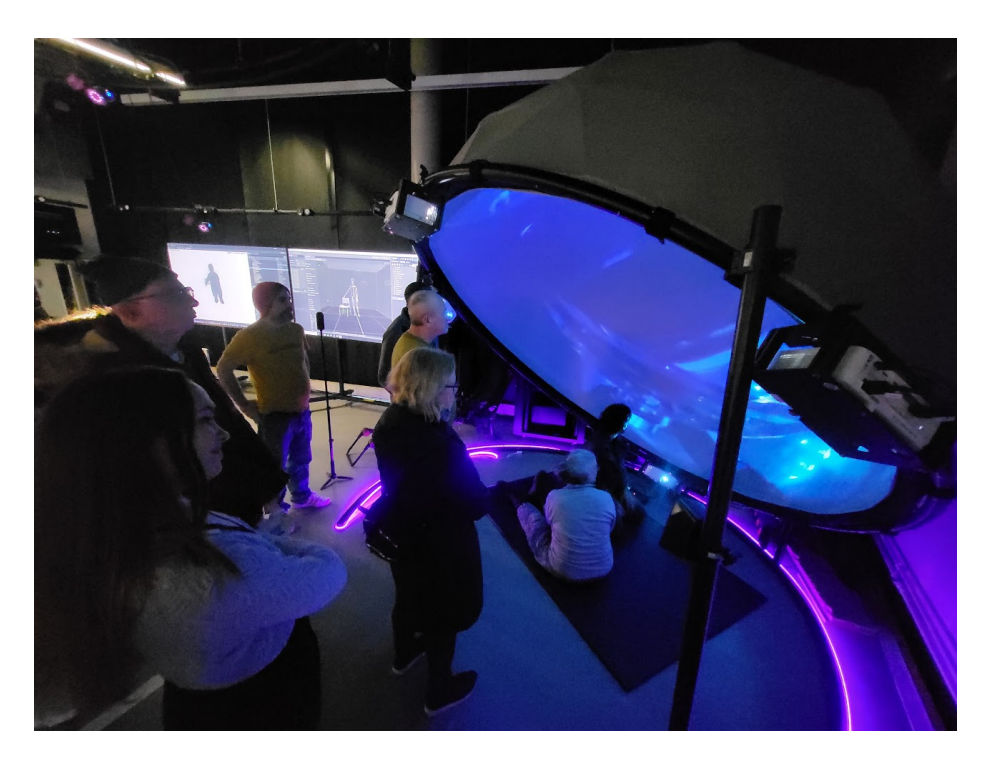
Fig. 3. Participants in the UT workshop assess their interaction experience with underwater footage using a semi-portable immersive dome provided by Fulldome.pro. Reproduced from [11].

work packages consistently emphasised the importance of incorporating a social interaction component into the technology design.