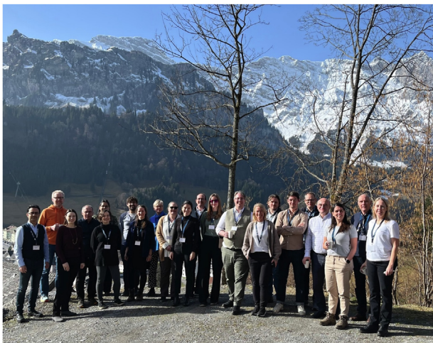
Fig. 1. Participants of the conference in front of the Swiss Alps.

in diagnostics and highlighted future applications, including antimicrobial resistance and gut microbiome studies. However, there is a need for cost-benefit studies and the involvement of economists to make a compelling case for the routine use of sequencing in healthcare settings.