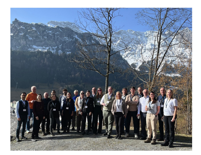
Fig. 1. Participants of the conference in front of the Swiss Alps.

in diagnostics and highlighted future applications, including antimicrobial resistance and gut microbiome studies. However, there is a need for cost-benefit studies and the involvement of economists to make a compelling case for the routine use of sequencing in healthcare settings.