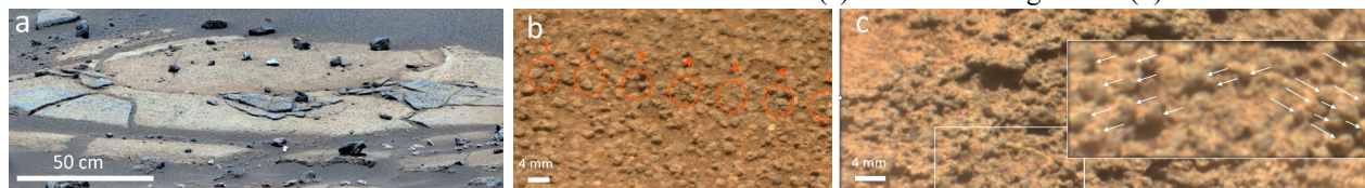
Fig. 3. a) Concentric feature at Amundsen (Mastcam-Z). b) Carbonate-rich coarse-grain soil target Toothawara (RMI). c) Rough texture of Baresand Point target at Turquoise Bay (RMI). Inset shows darker grains similar in size to the soil grains, apparently weathering out of bedrock.