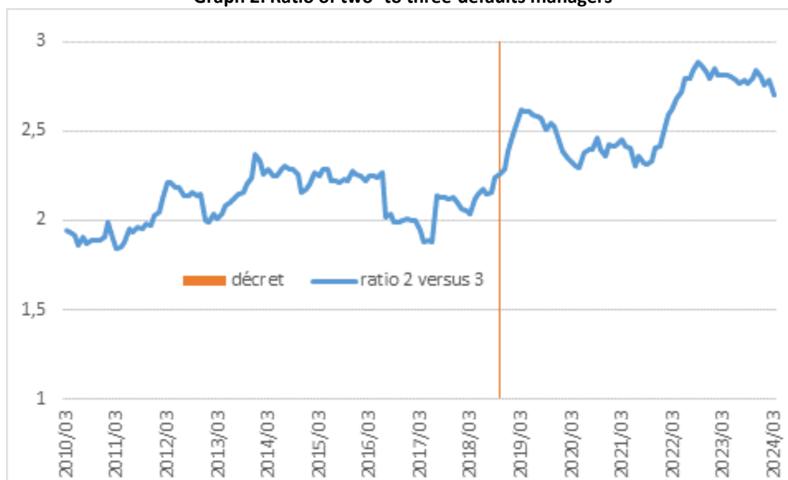
Graph 2: Ratio of two- to three-defaults managers

This ratio increased very quickly at that time, over three months, which is not consistent with a risk-taking channel that would induce default after a while, but rather with strategic failures directly linked to private benefits in case (and only in case) of defaults. Therefore, these empirical results are consistent with the assumption in the present model that firms can decide to default strategically based on private benefits, even if moral hazard issues and risk-taking are assumed away, which is innovative w.r.t. Giroud et al. (2012) and Schoenherr and Starmans (2022) .