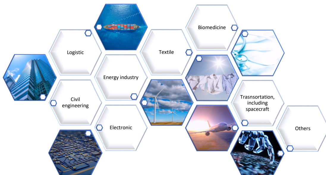
Figure 3. PCMs—main applications.

Among others, an important application is in the area of energy management, in which a PCM was also investigated as an element of Li-ion battery thermal management system to improve energy efficiency [40]. Another application in this area is a reduction of heating loads for rooms with air-conditioners [18]. It is also worth mentioning modern applications for these materials such as thermo-responsive dielectric switching/pulsing materials and temperature-sensitive electrical switching materials [41,42]. This kind of solution has potential in applications of next-generation smart electronic/electrical technology, including temperature sensors, smart switches, phase shifters, and varactors [41,42].