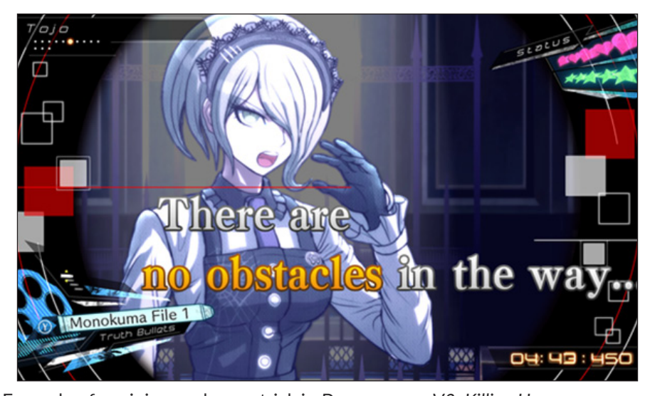
Figure 1: Example of a minigame, here a trial, in Danganronpa V3: Killing Harmony.

Second, we develop from the notion of narrative video games with one of their prominent examples, visual novels. Developed initially in Japan (Choi 2019; Crimmins 2016), the genre gained notoriety outside of Japan, to the point that they influence the design of Western games (e.g., Doki Doki Literature Club! [Team Salvato 2017] and Neo Cab [Chance Agency 2019]). With their anime–style visuals, they bring together a range of ludic and interactive forms to create complex narratives. Some visual novels task players with reading thousands of lines and making choices to alter the narrative, like in Chaos;Child (Spike Chunsoft 2014), while others may include minigames or adventurous sequences, such as in Danganronpa V3: Killing Harmony (Spike Chunsoft 2017). For example, in the game, players must "shoot" the lies or contradicting arguments to unravel the truth (see Figure 1 ).