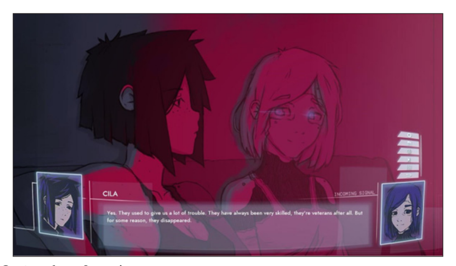
Figure 3: Capture from Synergia.

The story unfolds linearly. In order to progress in the game, the player only needs to press "next" on their controller "A" or "X" buttons, a mechanic that will display the text in Figure 3. This minimal gesture is similar to that of turning a page. Throughout the 20-hour gameplay, the player has up to a dozen choices. Each choice offers two narrative directions. All these characteristics indicate a low interaction level, as the player's agency is being kept at a minimum. However, the narrative choices made by the players are important in the narrative and will influence the gaming experience. For example, the first choice the player needs to take is to choose between killing an android, strongly suspected of having become violent towards humans, or to let it run away. At this point in the game, the player has little information, but they can deduce the android was subjected to a violent treatment, and understand the protagonist's hierarchy has already made up its mind about the guilt of this android. This choice dictates how the