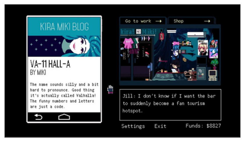
Figure 6: Interface through which the player manages Jill's life in Va-11 Hall-A.