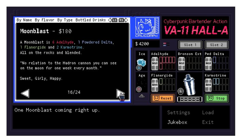
Figure 5: Example of an order being fulfilled by Jill in Va-11 Hall-A.

The same can be said of Coffee Talk (Toge Productions 2020), in which preparing comforting drinks helps to build confidence with characters, or Robotics;Notes (5pb 2012), where decisions are set by battles on a gaming application in the protagonist's smartphone, through a mise en abyme of interfaces.