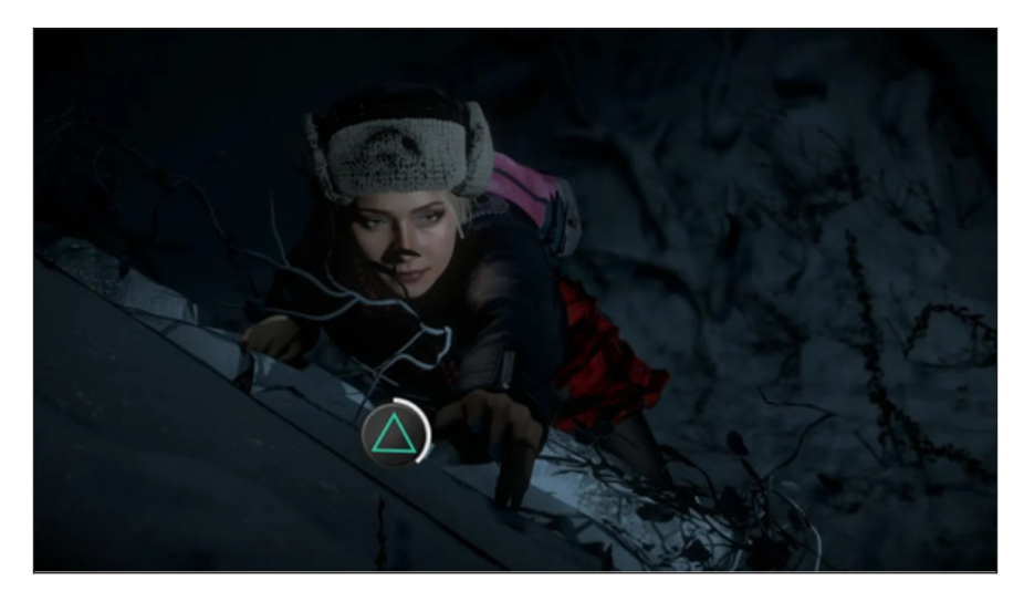
Figure 2: Example of a QTE in the interactive horror game Until Dawn (Supermassive Games 2015).