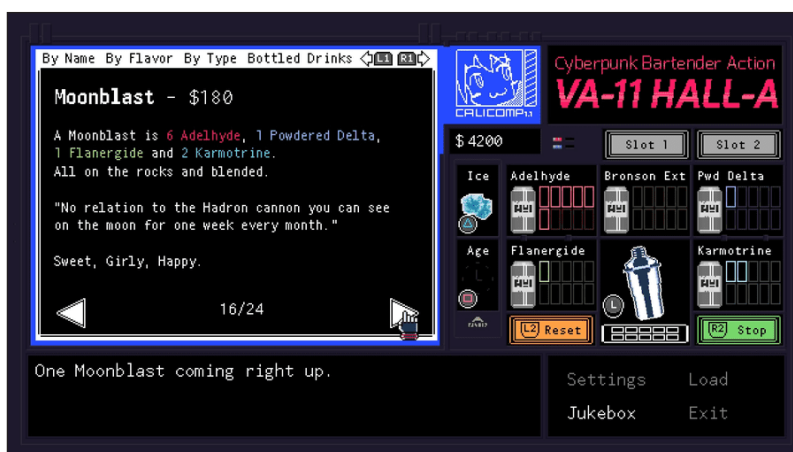
Figure 5: Example of an order being fulfilled by Jill in Va-11 Hall-A .

The same can be said of Coffee Talk (Toge Productions 2020), in which preparing comforting drinks helps to build confidence with characters, or Robotics;Notes (5pb 2012), where decisions are set by battles on a gaming application in the protagonist's smartphone, through a mise en abyme of interfaces.