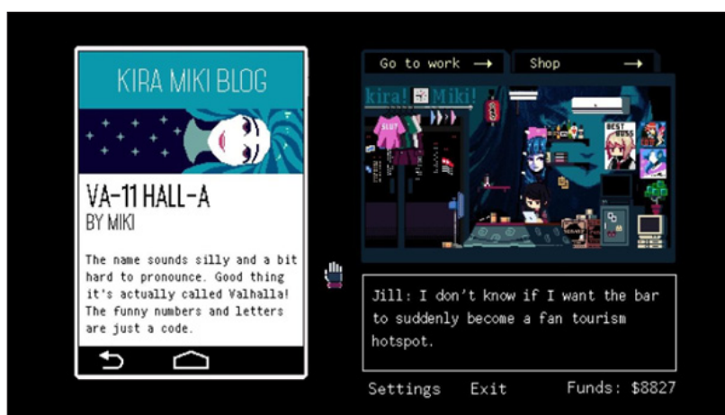
Figure 6: Interface through which the player manages Jill's life in Va-11 Hall-A .