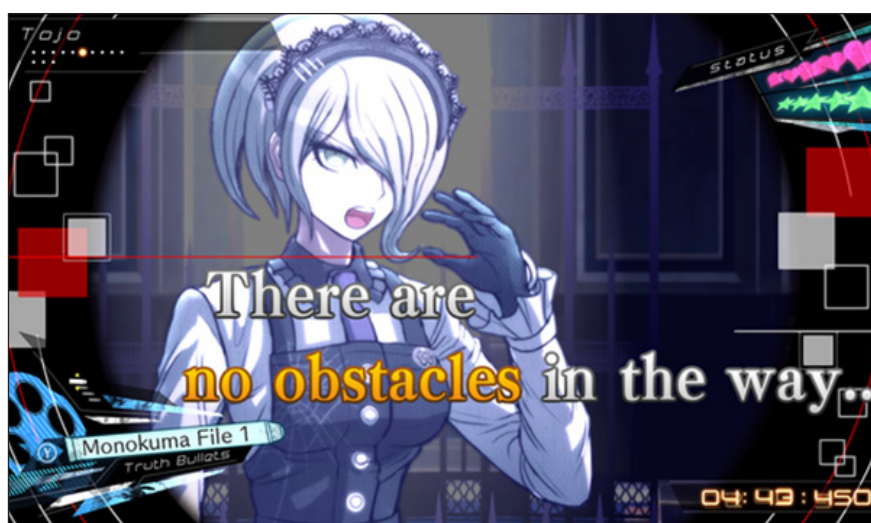
Figure 1: Example of a minigame, here a trial, in Danganronpa V3: Killing Harmony .

Second, we develop from the notion of narrative video games with one of their prominent examples, visual novels. Developed initially in Japan (Choi 2019; Crimmins 2016), the genre gained notoriety outside of Japan, to the point that they influence the design of Western games (e.g., Doki Doki Literature Club! [Team Salvato 2017] and Neo Cab [Chance Agency 2019]). With their anime-style visuals, they bring together a range of ludic and interactive forms to create complex narratives. Some visual novels task players with reading thousands of lines and making choices to alter the narrative, like in Chaos;Child (Spike Chunsoft 2014), while others may include minigames or adventurous sequences, such as in Danganronpa V3: Killing Harmony (Spike Chunsoft 2017). For example, in the game, players must “shoot” the lies or contradicting arguments to unravel the truth (see Figure 1).