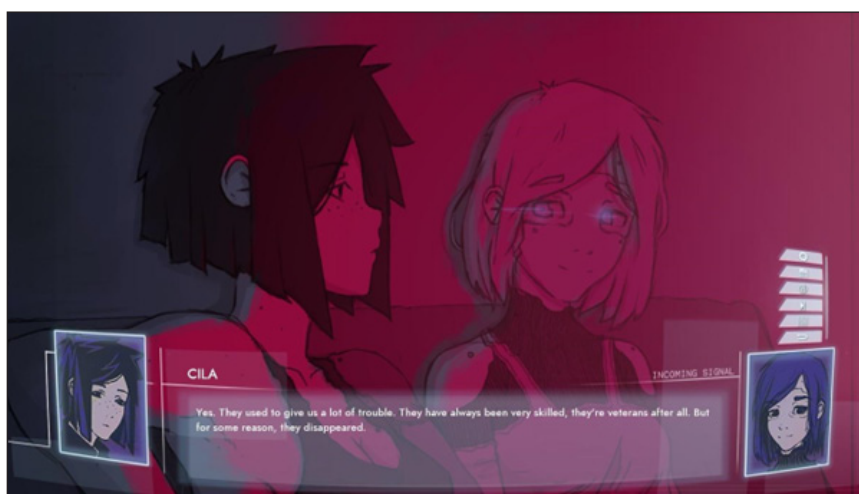
Figure 3: Capture from Synergia .

The story unfolds linearly. In order to progress in the game, the player only needs to press “next” on their controller “A” or “X” buttons, a mechanic that will display the text in Figure 3 . This minimal gesture is similar to that of turning a page. Throughout the 20-hour gameplay, the player has up to a dozen choices. Each choice offers two narrative directions. All these characteristics indicate a low interaction level, as the player’s agency is being kept at a minimum. However, the narrative choices made by the players are important in the narrative and will influence the gaming experience. For example, the first choice the player needs to take is to choose between killing an android, strongly suspected of having become violent towards humans, or to let it run away. At this point in the game, the player has little information, but they can deduce the android was subjected to a violent treatment, and understand the protagonist’s hierarchy has already made up its mind about the guilt of this android. This choice dictates how the