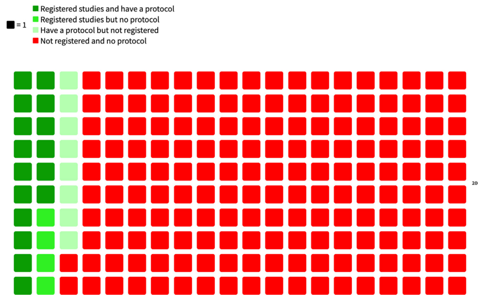
Figure 2. Registration and protocol status of included studies ( N = 200 ). (For interpretation of the references to color in this figure legend, the reader is referred to the Web version of this article.)

Lancet and the BMJ have published editorials to encourage registration [9,10]. Publication of protocols within the original study is encouraged by four journals (Appendix 5).