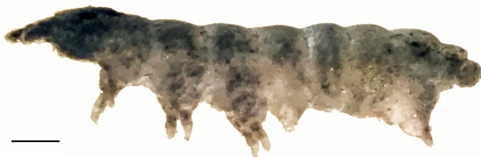
Figure 2. Superodontella tyverica Kaprus, 2009 (Odontellidae) habitus. Scale bar: 10 µm.

Distribution. Palaearctic (Kaprus, 2009). This species is reported for the first time from Iran.