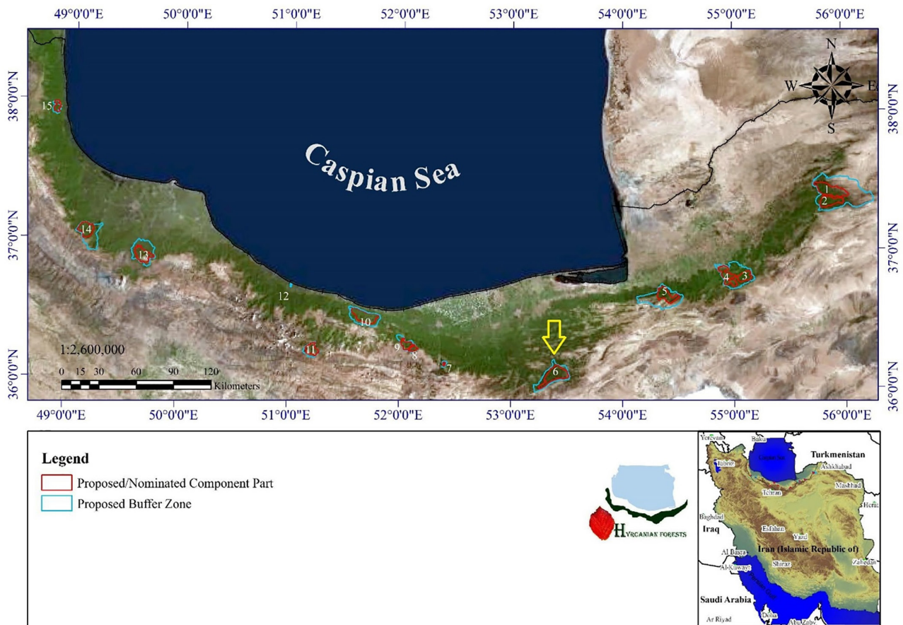
Figure 1. Map of Hyrcanian forests in northern Iran including Bula forest (6) in Farim city located in Sari region in Mazandaran province.