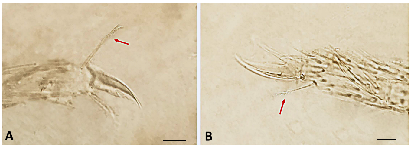
Figure 4. Pseudosinella spp. (Entomobryidae) on slide; A. Pseudosinella cf. decipiens tibiotarsus with dorsal clavate tenent hair; B. P. immaculata tibiotarsus with dorsal pointed tenent hair. Scale bar: 10 µm.