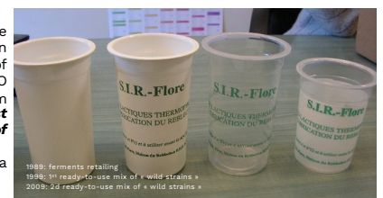
1996: ferments retailing 1996: 1 st ready-to-use mix of « wild strains » 2009: 2 d ready-to-use mix of « wild strains »

In this case, microbes are inherently regarded as an integral component of terroir. As per the DPO specificity guidelines from 1996, “The strains must respect the specificity of the [cheese] flora”* . Terroir is delineated on a regional scale.