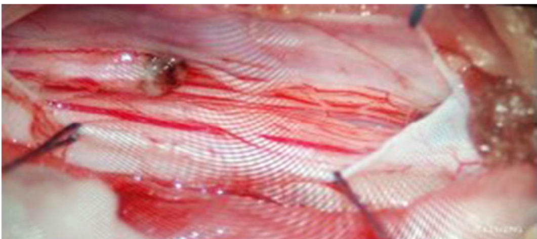
Fig. 3: Filum terminale stump post lipoma resection