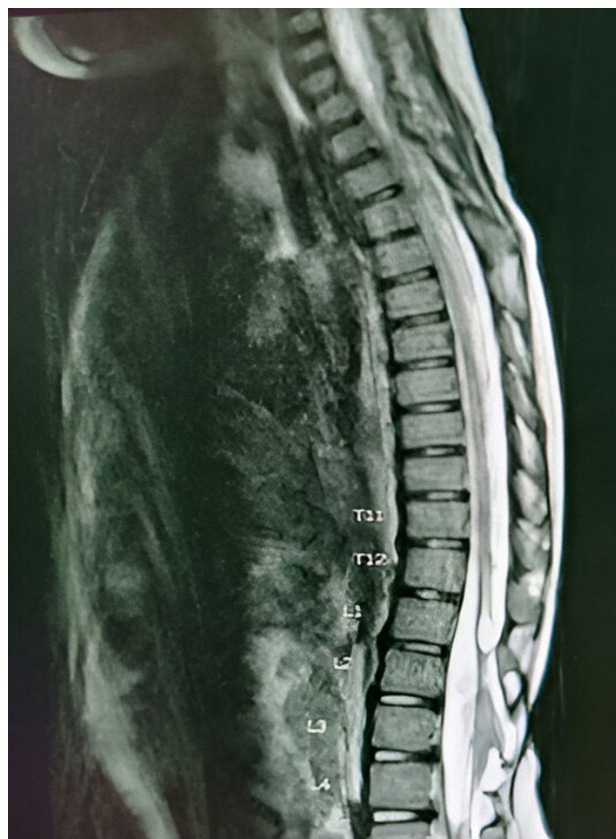
Fig. 1: MRI whole spine sagittal view

The child was moderately built, conscious and oriented to time, place and person. The developmental milestones were normal for age. On physical examination she had a midline horizontal scar of previous surgery over the dorso-lumbar spine. There was no evidence of any scoliotic deformity or any other cutaneous stigmata over the spine. Examination of lower extremities was suggestive of bilateral equinovarus deformity. Neurologic exam revealed she had Power 5/5 in bilateral upper limbs, hips and knees, but had Power 3+/5 in Ankle dorsiflexion and plantar flexion. Sensation was intact in all dermatomes. Ankle jerk was exaggerated bilaterally.