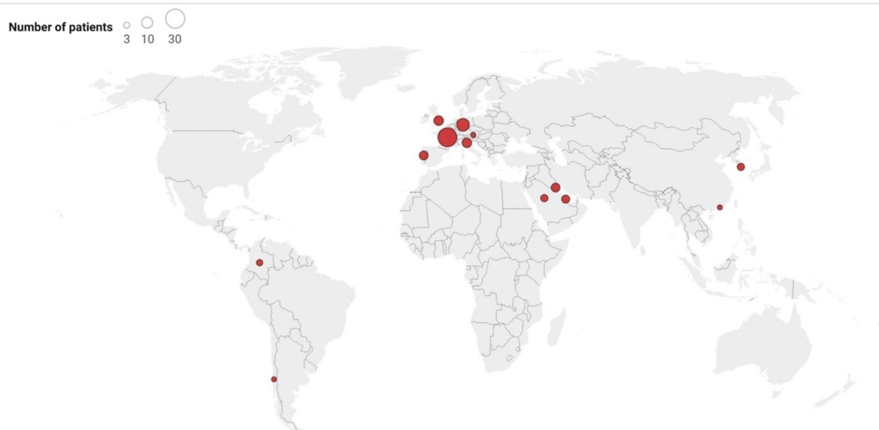
Fig. 1 Distribution of the number of patients included per country

Only patients with confirmed pulmonary tuberculosis due to Mycobacterium tuberculosis were included. Based on thoracic computed tomography findings, all included patients were classified as having either cavitory or miliary TB. A cavitory lesion was defined as a gas-filled space within a pulmonary mass, nodule, or consolidation, with the cavity wall typically measuring at least 2 mm in thickness. The presence of at least one cavitory lesion in the lungs classified a patient as having cavitory TB. Miliary TB was defined by multiple small-size (<3 mm diameter) nodules randomly distributed throughout both lungs. The centers reported following the ELSO guidelines [4] and the mechanical ventilation protocol from the EOLIA