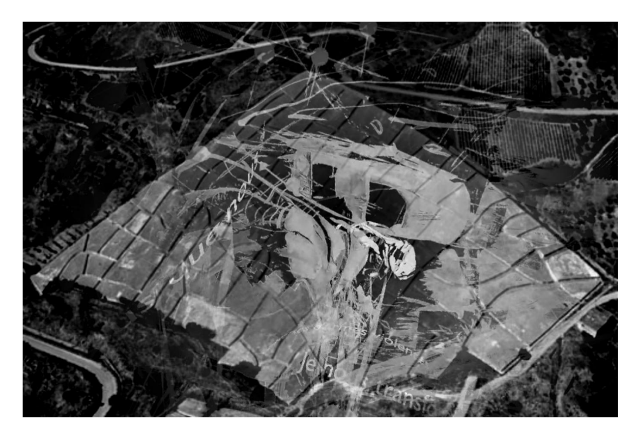
Figure 4 – Alberto Burri, Il Cretto di Burri , cement sculpture, 150 x 35,000cm, 1984, Gibelina Vecchia / in the perspective of the Earth, composition with ANDOMHAN User Experience.

This encounter between Exteriority/Interiority in the reflection of the subject at the interface of the World is found in Alberto Burri's monumental work, Cretto di Burri . This work is profoundly profane in its heritage architexture (Lefebvre, 2000) and its heritageizing emotion. Following an earthquake in 1968, the Sicilian town of Gibellina was completely destroyed. In the 10 years following the disaster, a new town (®≠MAKE) was built a few kilometers away, bearing the same name as the ruined one. To enhance the value of this project and restore the attractiveness of the rebuilt territory, artists took over the sites (of the new and old towns) to install sometimes monumental works. Italian artist Alberto Burri created a monumental work of art in the heritage sense of the term, but also in the anthropomorphic sense. He had the site cleaned. The ruins, i.e. what is already-there , are removed. Leaving a space of interiority in the place to be recreated and recartographed in a new, sensitive relationship. Man-height blocks are then placed on the terrain of the decimated city. These blocks re-form a material cadastre, in the landscape dimension of the city's heritage catastrophe.