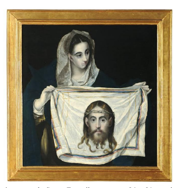
Figure 5 - El Greco, La Verónica con la Santa Faz , oil on canvas, 84 x 91cm, circa 1580, Museo Santa-Cruz, Toledo

This same system can be found in the shroud tradition. El Greco's La Verónica con la Santa Faz comes to mind.