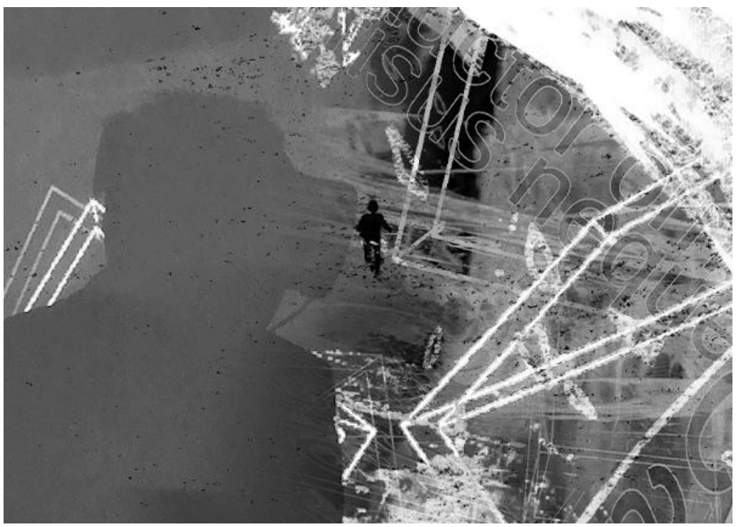
Figure 6 - Giovanni Anselmo, Entrare nell'Opera , photographie, 390 x 266cm, 1971, Museum of Modern and Contemporary Art of Trento and Rovereto / Private collection. Composition with user experience AN DOMHAN

He traces a fictional discourse, which is already only fiction and ®≠MAKE because Véronique is already wearing - again - her veil. A dialogue is established between the Earth and this YOU (second person) who splits into two - in the same way as the double relationship of bodies-in-presence is structured between the AR and the VR in AN DOMHAN. It's a YOU that calls us into the work (the immersive experience). The user is the lens in Anselmo's photography. Entrare nell'opera represents the artist running into the heart of the image, becoming the terrain and experience of the work created by the artist. It surpasses its own status as a semiotic index¹¹¹ to be the very terrain of experience.