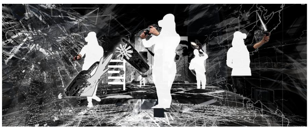
Figure 2 - AN DOMHAN UX®, the composition of several user experiences

Starting with the immersive mixed reality work AN DOMHAN<sup>4</sup>, we open up a relationship with tangible and intangible heritage in a dynamic of narrative points of view.