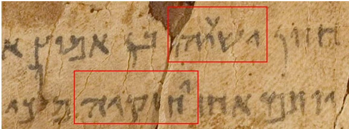
Figure 2: Suspended ayin (ישעיהו) and yod (יחזקיה) in Isaiah 1:1, 1QIsa. Image used under the terms of fair use.

A priori, either Manasseh or Moses seem to fit the context, as Moses, like Jonathan, was also a Levite. There is no recorded grandson of Moses whose name was Jonathan, however, with 1 Chr 23:16 listing only “Shebuel the chief” as a son of Gershom. This Jonathan could have been an otherwise unknown descendant, or he could have been unrelated to Moses.