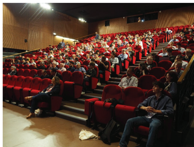
A view of the Marthe Condat Auditorium.