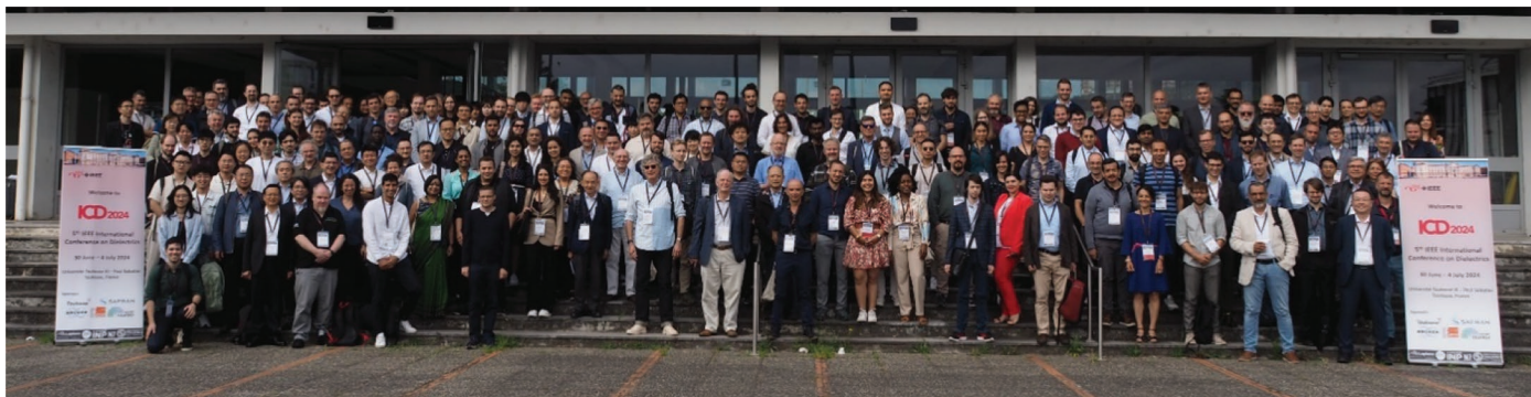
Group photo of the International Conference on Dielectrics (ICD) 2024 taken outside the main hall.

ICD featured a rich program with 8 oral sessions covering 41 regular oral communications and 4 poster sessions. The first