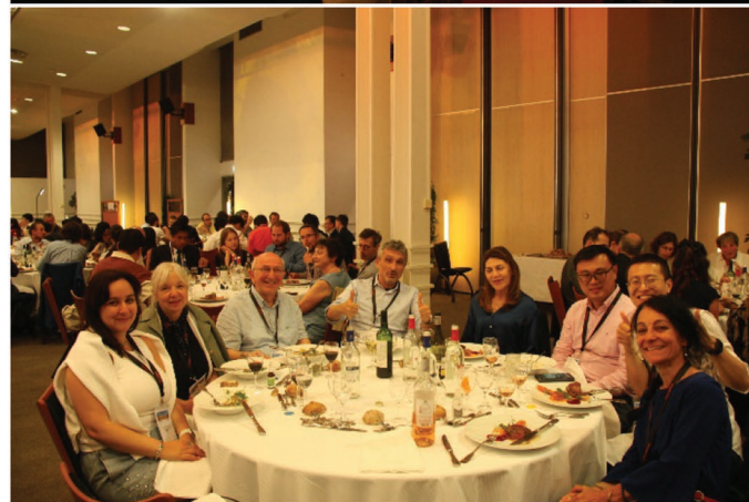
The banquet at Espace Vanel.

Committee, the Executive Committee, the WiE Group at DEIS, the authors, and the reviewers.