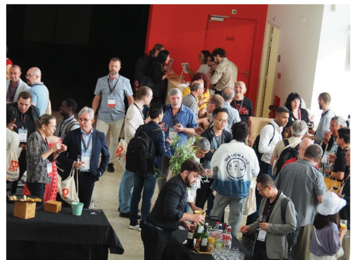
Reception cocktail in the conference hall.