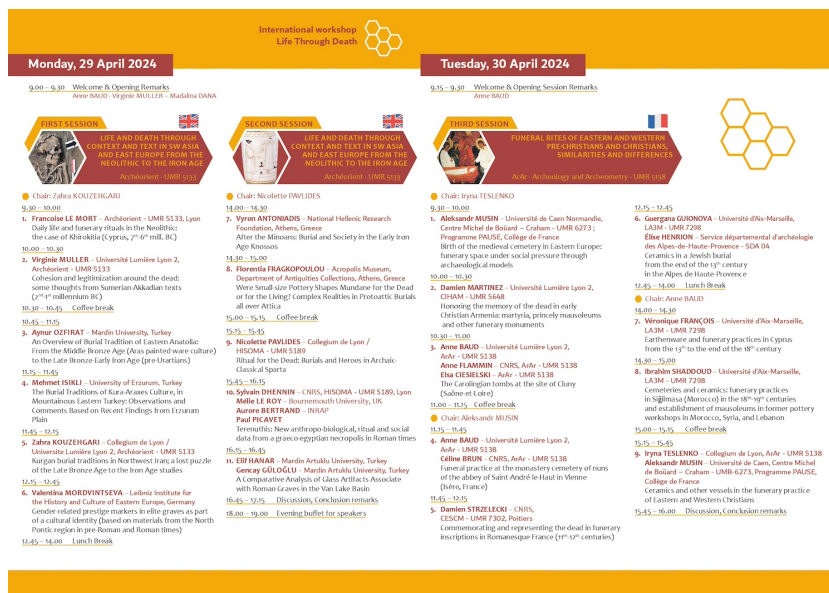
Fig. 1: The program of the workshop