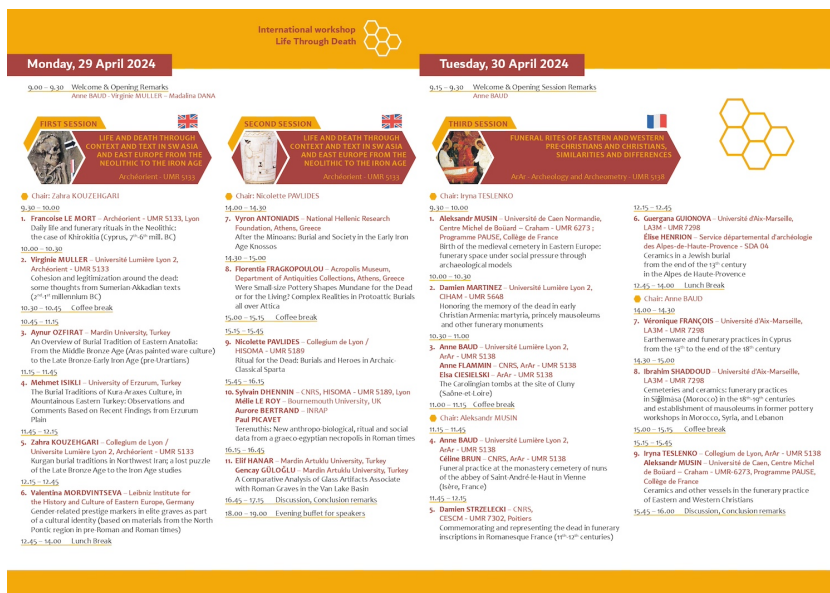
Fig. 1: The program of the workshop