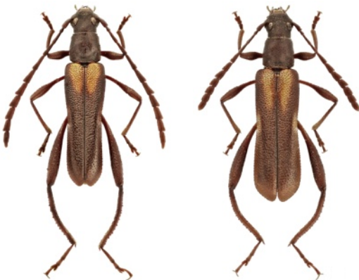
Illustration de la couverture :

Tatsuya Niisato & Tomáš Tichý . . . . . 1 – 4