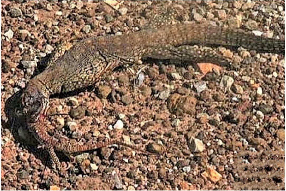
Figure 6. A Sand Goanna ( Varanus gouldii ), killed on the road while in the process of consuming a juvenile of its species on the Main Darwin Highway, Katherine, Northern Territory, Australia. December, circa 1995.