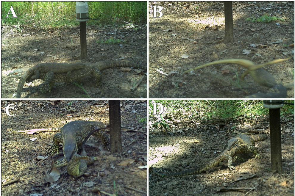
Figure 5. A sequence of images documenting an interaction of cannibalism between two Sand Goannas ( Varanus gouldii ).