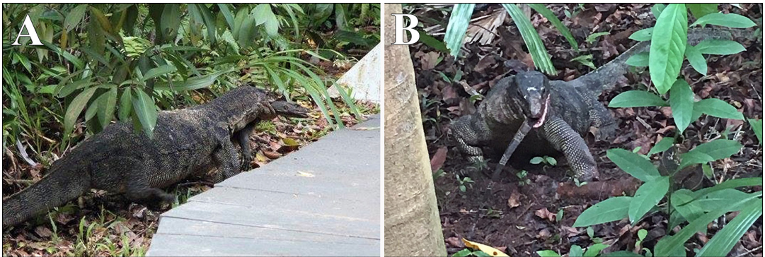
Figure 3. An adult Varanus salvator macromaculatus grasps a conspecific's neck, lifts it off the ground, and shakes it violently (A), then devours it whole (B).

Cannibalism in Varanus salvator bivittatus . On 7 October 2024 at 10:22 h at the entrance to a hotel in Jimbaran, southern Bali, Indonesia (8.7785°S, 115.1672°E), we came upon an attempted predation scene on a concrete bank next to a water reservoir. A subadult (approximately 40–50 cm in total length) Two-striped Water Monitor, Varanus salvator bivittatus (Kuhl, 1820), was observed with another smaller lizard in its mouth (Fig. 4A). It was another, juvenile specimen of V. s. bivittatus (approximately 15–20 cm in total length) trying to free itself from the jaws of the former. Attempts to bite the aggressor in its mouth were ineffective (Fig. 4B). The whole observation lasted < 5 min, when the larger individual, with its prey in its mouth, entered the water and drifted away.