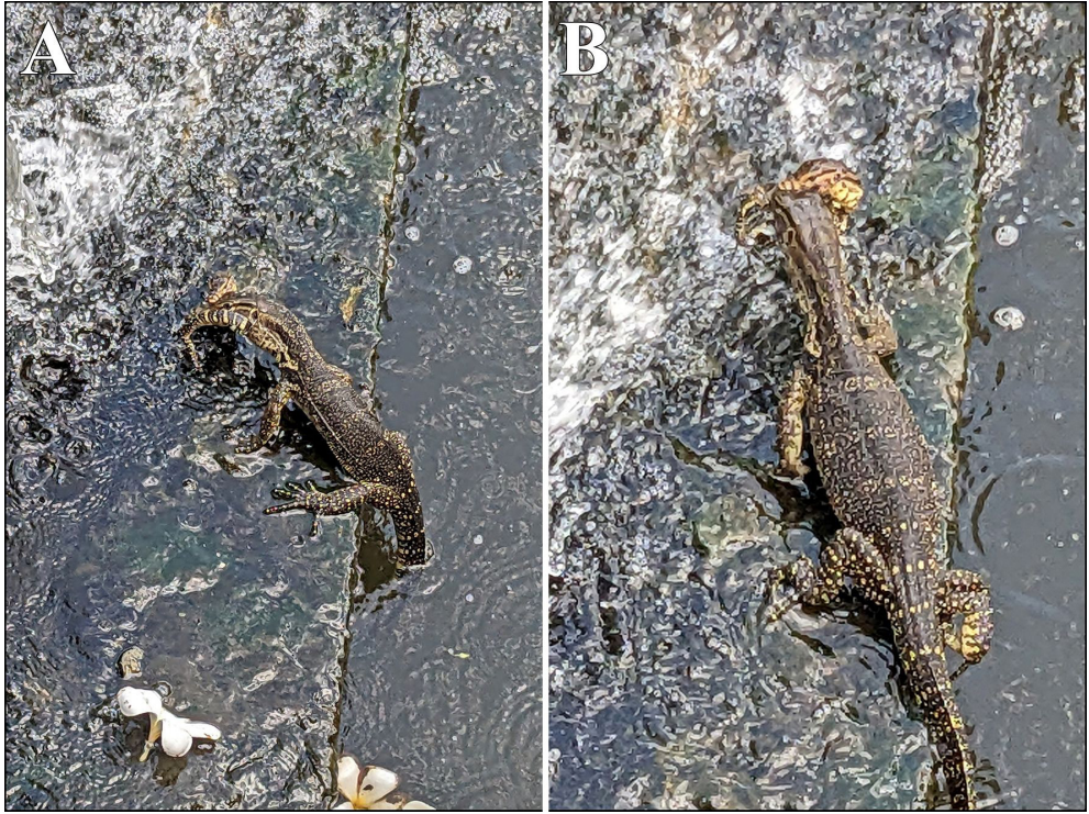
Figure 4. (A) A subadult Varanus salvator bivittatus holds a juvenile conspecific at midbody, despite (B) the juvenile biting it.