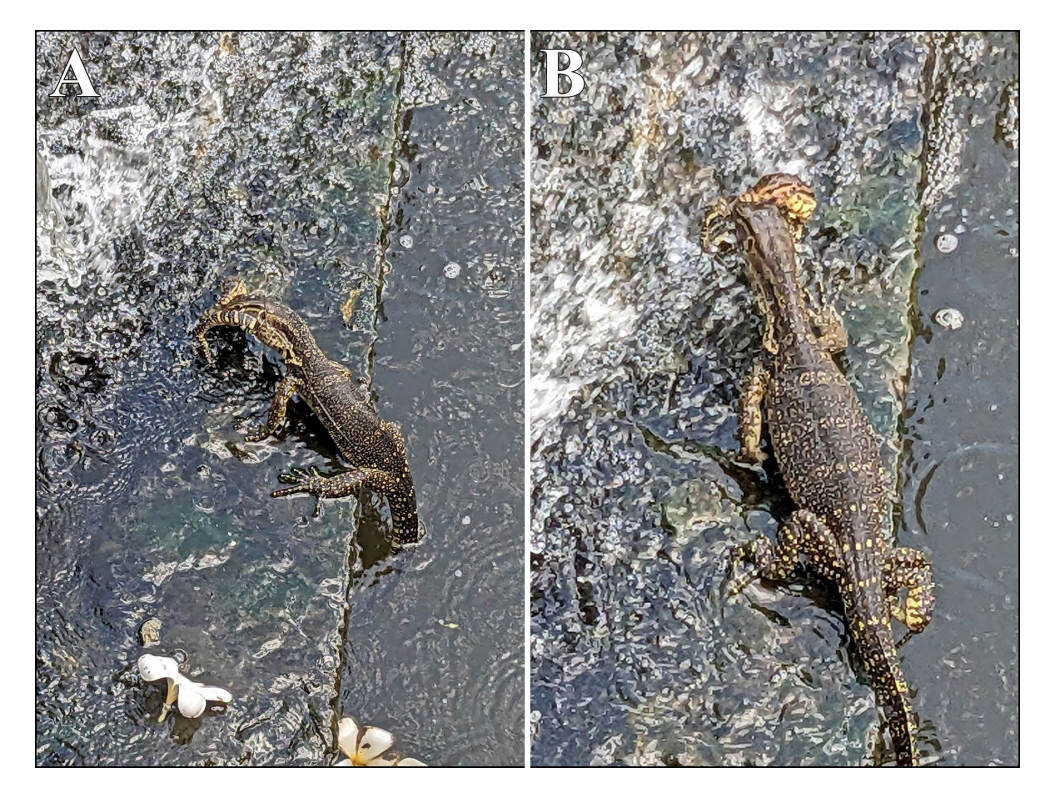
Figure 4. (A) A subadult Varanus salvator bivittatus holds a juvenile conspecific at midbody, despite (B) the juvenile biting it.