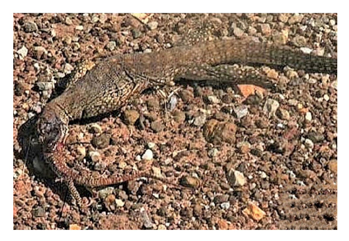
Figure 6. A Sand Goanna ( Varanus gouldii ), killed on the road while in the process of consuming a juvenile of its species on the Main Darwin Highway, Katherine, Northern Territory, Australia. December, circa 1995.