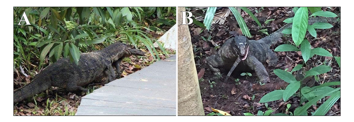
Figure 3. An adult Varanus salvator macromaculatus grasps a conspecific's neck, lifts it off the ground, and shakes it violently (A), then devours it whole (B).

Cannibalism in Varanus salvator bivittatus . On 7 October 2024 at 10:22 h at the entrance to a hotel in Jimbaran, southern Bali, Indonesia (8.7785°S, 115.1672°E), we came upon an attempted predation scene on a concrete bank next to a water reservoir. A subadult (approximately 40–50 cm in total length) Two-striped Water Monitor, Varanus salvator bivittatus (Kuhl, 1820), was observed with another smaller lizard in its mouth (Fig. 4A). It was another, juvenile specimen of V. s. bivittatus (approximately 15–20 cm in total length) trying to free itself from the jaws of the former. Attempts to bite the aggressor in its mouth were ineffective (Fig. 4B). The whole observation lasted < 5 min, when the larger individual, with its prey in its mouth, entered the water and drifted away.