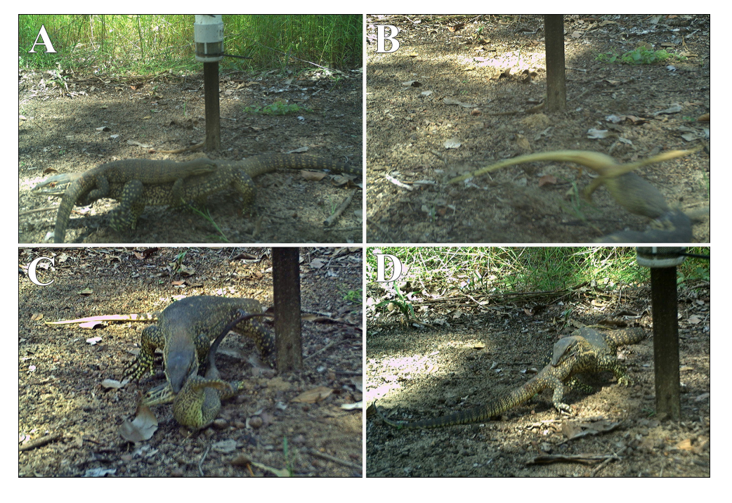
Figure 5. A sequence of images documenting an interaction of cannibalism between two Sand Goannas ( Varanus gouldii ).