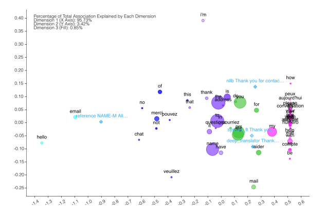
Figure 3: Correspondence analysis of the reference translation and tree predictions: fine-tuned Systran ( systran_ft ), NLLB-200-3.3B ( nllb ), and Deep translator deep-translator .

In Figure 3, we used correspondence analysis in Voyant Tools to compare our three predictions with the reference translation. The results suggest that the reference translation was carried out with human intervention, as it is clearly opposed