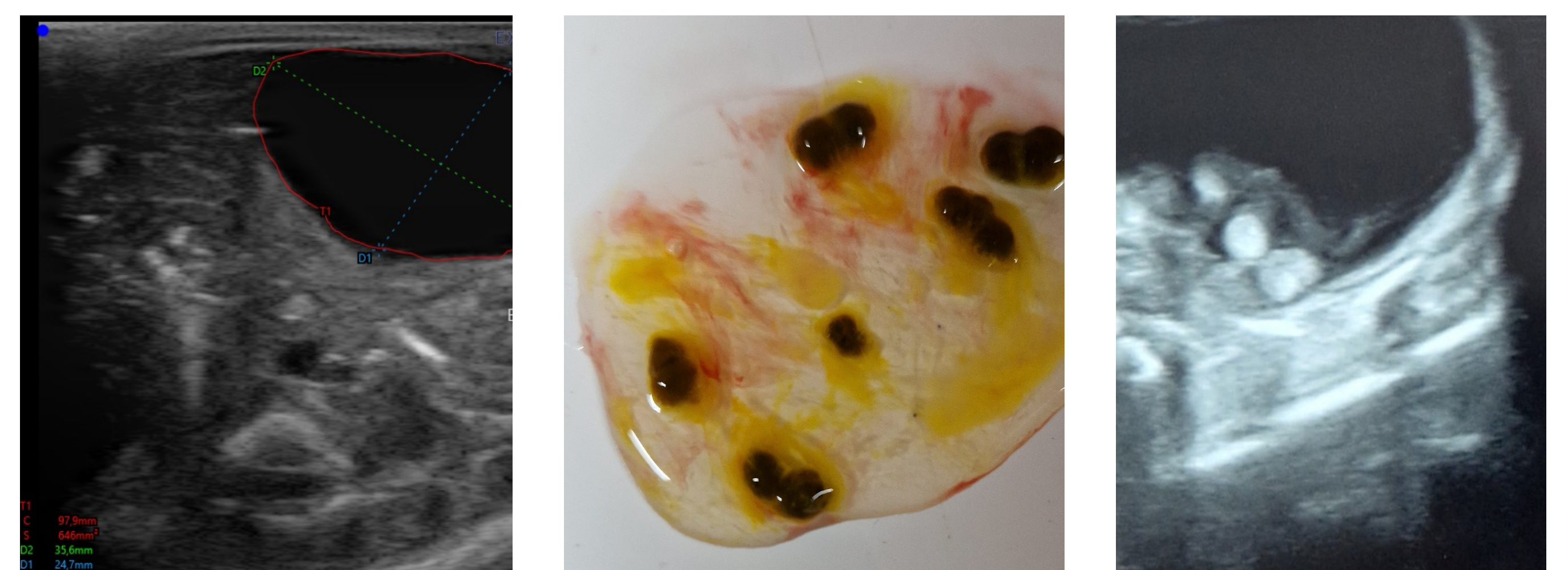
In stillborn piglets, stomach is full of hypoechogenic amniotic fluid. Meconium beads may provide small round hyper-echogenic signals.