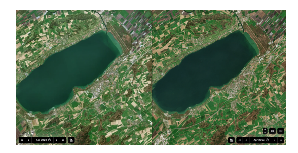
Fig. 1. Illustration of two NIMBO images acquired in one year interval over the Morat lake, Switzerland (april 2022 and april 2023)

However, because of cloud coverage, aerosols and other acquisition difficulties, S2 data are valuable but challenging to use. The challenges include the large volume of data, the multispectral nature of the data, and the rapidly evolving tools for processing the data. In response of these challenges, some global products have been developed to simplify access to this data, including user-friendly platforms for visualizing and acquiring global information on S2 data. These platforms