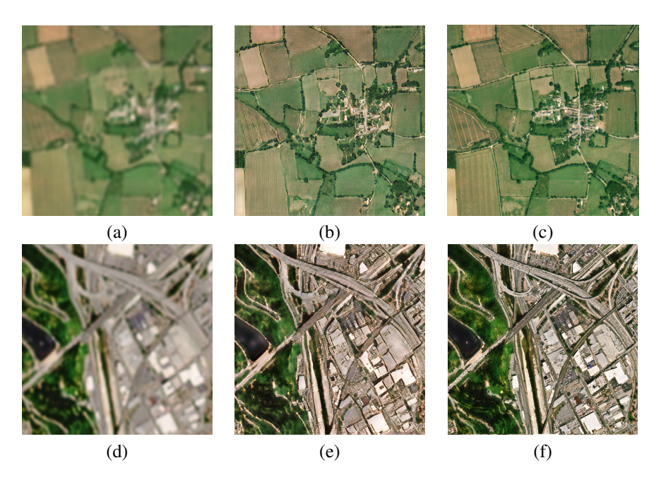
Fig. 3. Illustration of super-resolution on three different areas. (a,d): NIMBO images (10m); (b,e): estimated super-resolution (2.5m); (c,f): closest recolorized real high resolution image for a localization in France (department of Loire-Atlantique) and USA (Los Angeles)