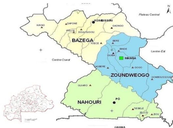
Fig 1. Map of the study site.

The sample of households comes from a list of households that had been surveyed between November 2019 and March 2020. Households were initially randomly selected using a spatial sampling strategy, with GPS points drawn in the three study locations. Enumerators followed a predetermined random walk to select one household per GPS point. The sample size was initially determined to detect an 8.5 percentage points increase in the proportion of households cooking with a clean cooking appliance (gas stove) with a power of 0.8 and statistical