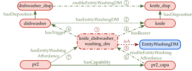
Fig. 3: Ontological pattern example allowing the inference of a Dispositional Match (DM) and a related affordance. -\!-\!-\!> are inferences by equivalence, -\!-\!> are inferences by the custom reasoner, and \cdots\!-\!> are inferences by property chain. Numbers like \textcircled{x} correspond to the order of inferences.

we infer that their dispositions can interact together ( (dishwasher\_disp, enableWashingDM, knife\_disp) ). The transition from the dispositions individuals to the effective entities is once again done through a property chain hasDisposition•enableWashingDM•isDispositionOf \implies hasWashingDM . We thus infer the relation ((dishwasher, hasWashingDM, knife)) \textcircled{2} .