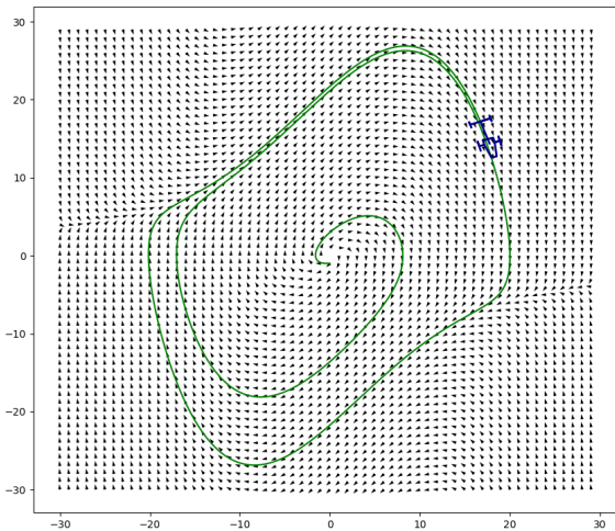
Figure 2: Simulation of a car with a trailer, where the trailer follows the Van der Pol vector field.