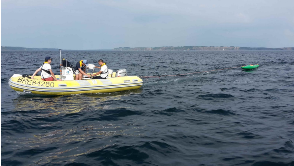
Figure 1: Picture of Boatbot searching for La Cordelière .