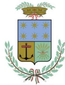
Provincia di Crotona