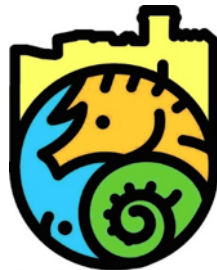
Area Marina Protetta CAPO RIZZUTO