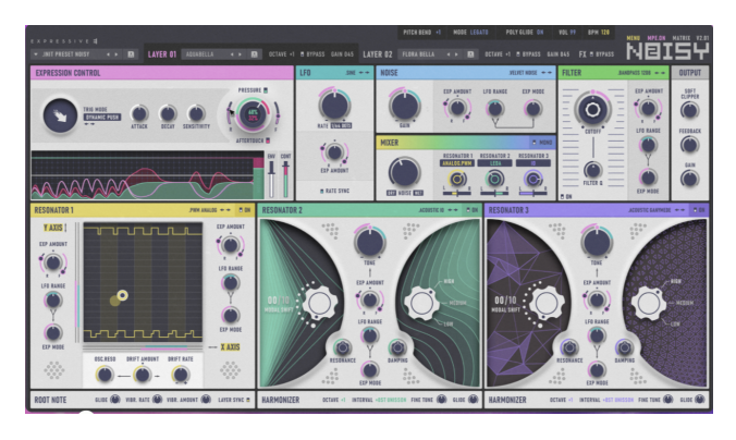
Figure 3: The Noisy2 plugin interface.

Noisy 1 and 2 products were largely created using FAUST, and benefited from a close collaboration between Expressive E's development team and GRAME, in particular in developing performance measurement and optimisation tools.