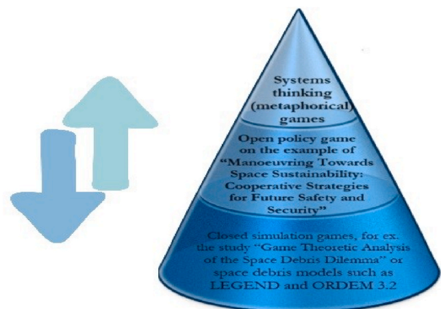
Fig. 1. The concept of the Cone of Abstraction, adapted to this research on space governance [22].

The dilemma between a detailed and a general approach (or in other words a low and high position on the cone of abstraction) may be observed in the context of space governance. For instance, Andrieux has noted that the company “Infinite Orbits” had chosen the jurisdiction of France for its operations due to its detailed and clear technical requirements regarding the supervision of space objects under its space legislation [23]. This company provides the orbital servicing in the geostationary orbit using autonomous navigation system capable of far and near range navigation for satellite rendezvous, handle Space