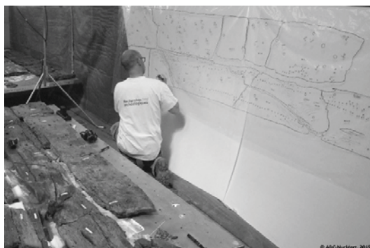
Figure 10: Each element was recorded after freeze-drying plastic film. It was then digitized to produce a plan used for conservation recording, follow-up plans and the archaeological survey.

However, the dismantling documentation still was not as accurate as we would have liked due to the low definition of the photos, which made it hard to see some of the archaeological data. Furthermore, the working conditions didn't allow zenithal shooting and there were light problems. We decided to make a 1:1 scale drawing of each face of every element from the shipwreck. These were done on a transparent plastic film with different ink pens (Figure 10). Once done, this freeze-drying plan was digitized with CAD. This was done prior to coring because of the potential for archaeological data to be lost during this process. It was a relief for conservators to know that all the data was recorded before they had to core nails holes.