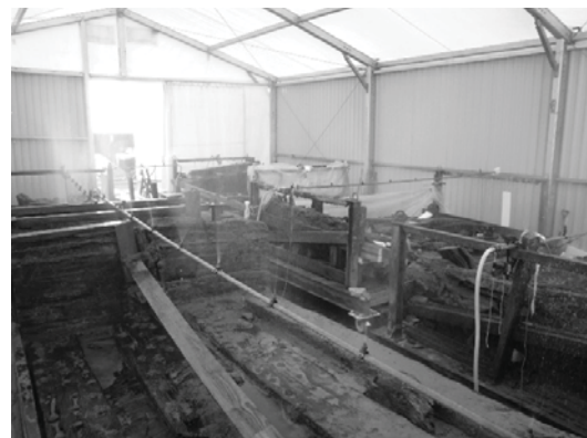
Figure 5: The storage warehouse in January 2014. Water was sprayed on the wood to keep it wet during dismantling.