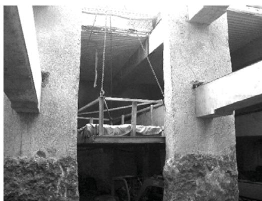
Figure 2: A section extraction from the rescue excavation. The dimensions of the construction provided the dimensions to cut the shipwrecks to allow removal.

In 2013, the opportunity arose to treat and display one of the boats and LSG4 was selected. The boat was originally 28 meters long and 5