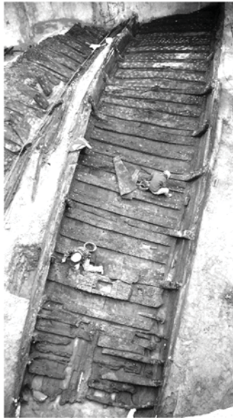
Figure 3: LSG4 as exposed at the rescue excavation.

meters wide although not all of it had been preserved (Figure 3). At the time it was excavated, due to the severe time constraints imposed for the excavation and the number of ships found, it was not possible to fully record any of the wrecks.