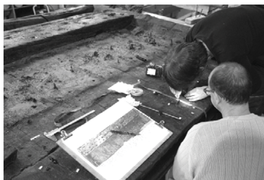
Figure 9: Intervention of the dendrochronologist to survey repair pegs in the flat-bottom timber during dismantling. The archaeologist had identified a possible change of the frame.