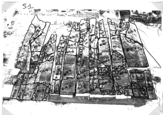
Figure 7: An example of dismantling documentation based on photos, to record flat bottom timbers fragmentation and its numbering.

During dismantling, samples were also collected for later study. Nearly 23 meters of