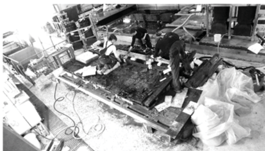
Figure 6: The removal of a frame during dismantling. After nail removal, wedges were placed to slightly push up the frame. Straps were used to fasten the frame to a new piece of wood. Then both were lifted with a crane.

Dismantling work (Figure 6) was planned around the archaeologist's availability to prevent data loss and to prevent the conservation work getting too far ahead of the recording work. A dismantling map was created based on photos, which allowed every piece of the boat to be drawn and numbered (Figure 7) and it allowed the location of nails and repairs to be indicated (Figure 8). These drawings were then digitized with CAD. Dismantled elements were organized for review by the archaeologist and the dendrochronologist (Figure 9). Dismantling drawings were used to create general plans to track freeze-drying, dendrochronology work and archaeological work, but also allowed us to record measurements such as the thicknesses of timber on the flat bottom part and at the bilge angles. However, it was found that some details could only be seen after freeze-drying so it was necessary to carry out a secondary review of the plans at this point.