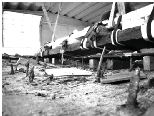
Figure 8: After frame removal, nails from the under part of the timber appeared clearly. No less than 2,100 nails were removed from the 15 meters conserved shipwreck. Their locations could be precisely recorded.

caulking textiles were removed from the sides and the flat bottom. This will permit future research into the production of the cloth, its recycling and the way it was prepared for use on the boat.