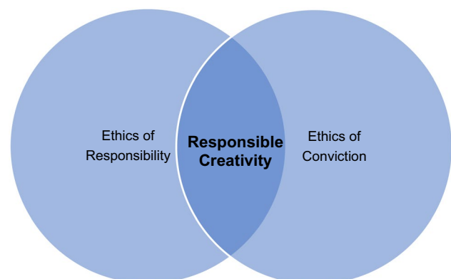
Fig. 1 Responsible creativity in the light of ethics

The central question at hand is the reconciliation of creativity, often aligned with an ethos of conviction [63, 64], with responsibility (as illustrated in Fig. 1). The ethic of conviction focuses solely on not betraying a value or transgressing a norm (e.g., truth, kindness), demanding absolute purity of means and showing indifference to consequences. What matters is not efficiency or the material triumph of a value, but the respect for it by the person acting and through their intention and action [65]. However, Hegel argued that this ethic's lack of pragmatism blurs the line between morality and immorality [66]. In contrast, the ethic of responsibility is rational in relation to a goal pursued by the actor, characterized by attention to means from both their practical efficacy and their consequences [67]. This ethic requires constructive critical thinking [67].