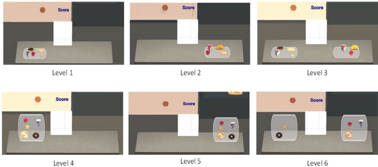
FIGURE 2. Levels in Enriched Virtual Environment (EVE).

objects at each level. As the game progressed, the placement of game objects demanded more effort by participants to move horizontally, vertically, and diagonally, as seen in Figure 2. The activities of the rehabilitation are based on solving and sensing with the progression or completion as the accomplishment element to encourage the desire to continue interaction with the rehabilitation application [66].