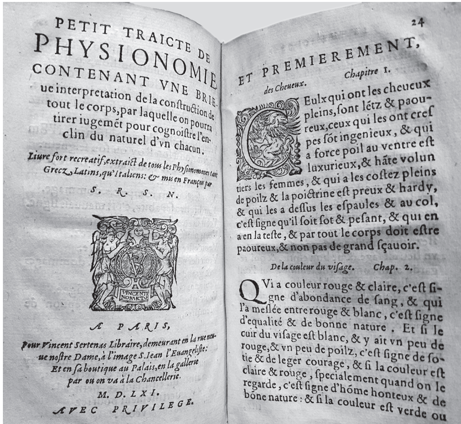
3. Title page of the "Petit traicte de physionomie" in the Prognostication naturelle (Chaumont, Bibliothèque municipale Les Silos, 8 B 1 A (2)).

various sections were not meant to be marketed alone, the process – if there is proof, such as parts surviving independently – was not akin to that of the constitution of Sammelbände . The creation of a Sammelband is centred on the concept of assembling diverse elements within a single volume, as is illustrated by the French term "recueil", from the verb meaning to gather together. The practice of removing parts of an edition to sell separately is diametrically opposed: it involves disassembling.