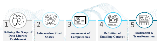
Figure 1. Data Literacy Approach

To start the 5-step-approach, a clear scope including stakeholder management needs to be defined, and an overview of the customer as-is situation must be derived (step 1). This includes identifying key stakeholders, performing a pre-study of current customer situation, engaging project road shows, adaptation to a customer designed assessment method and the definition of relevant data roles and data literacy levels within the organization.