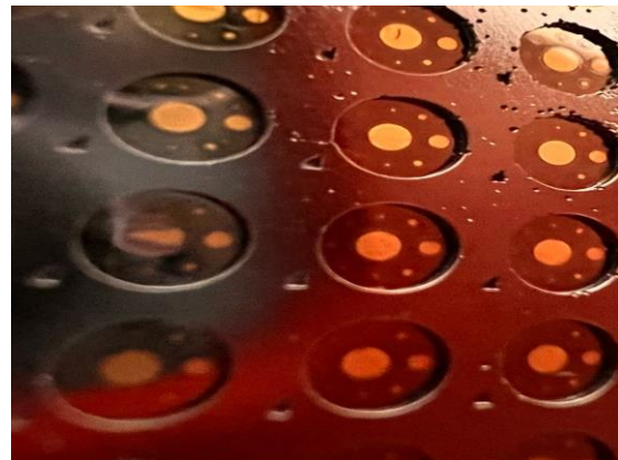
Backside view of pn diodes after Si and buffer removal